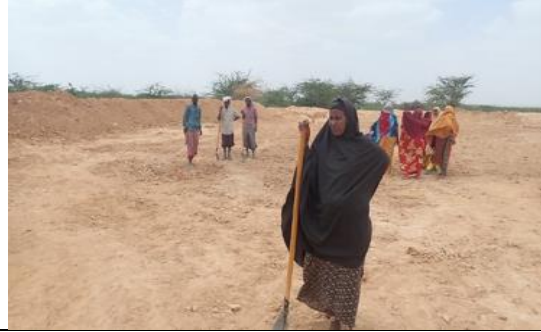
Beneficiary Working at site