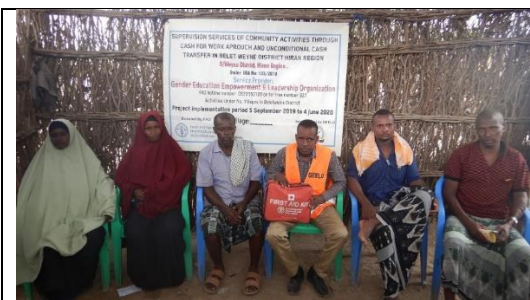
First Aid Distribution