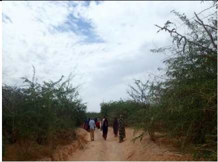
2500M before rehabilitation