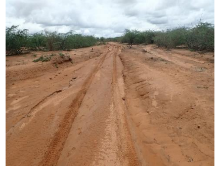
Jawiil Push Cleared