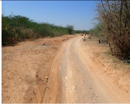
2500 M during rehabilitation-