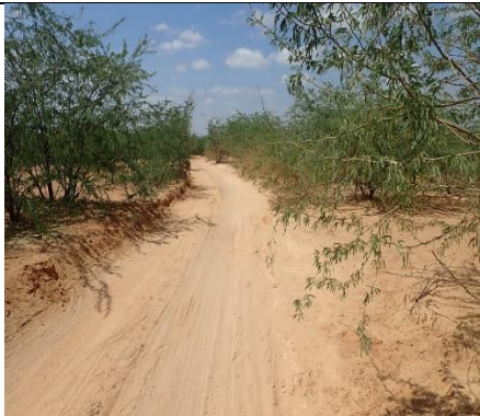
3500M before rehabilitation