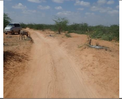
Jawiil push cleared