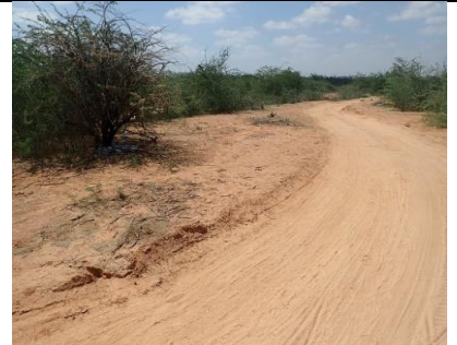
Jawiil Push Cleared