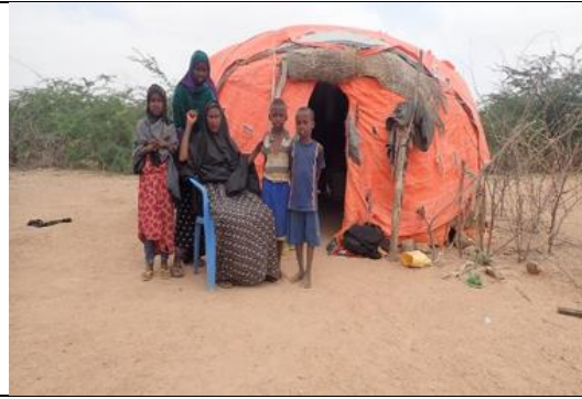
Beneficiary Family photographs