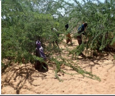
0 M before rehabilitation