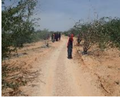
1500M during rehabilitation