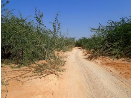
1500 M before rehabilitation