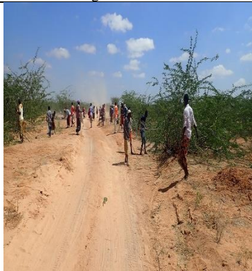
4500M before rehabilitation