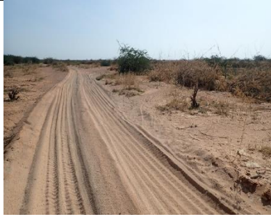
250 M during rehabilitation