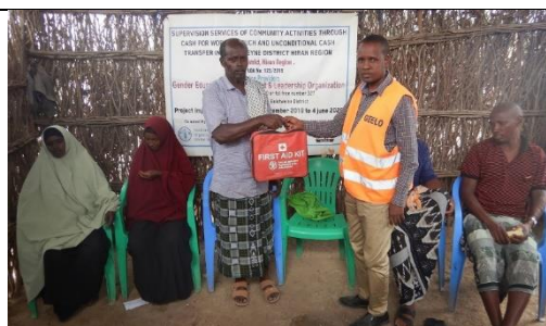
First Aid Distribution