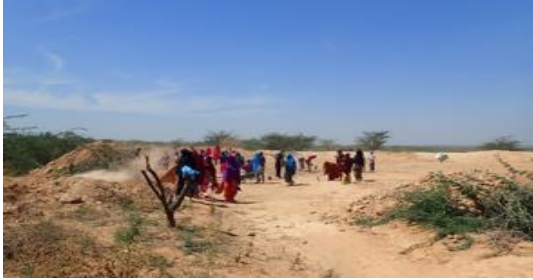
Beneficiary Working at site