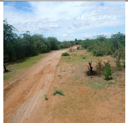
Jawiil Push Cleared