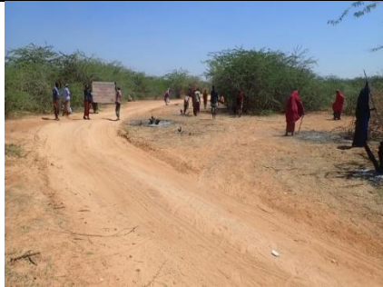
3500M during rehabilitation