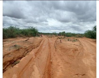
Jawiil Push Cleared