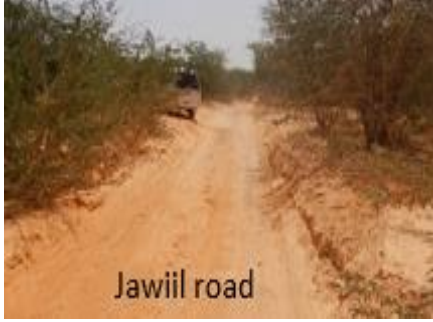
500M before rehabilitation