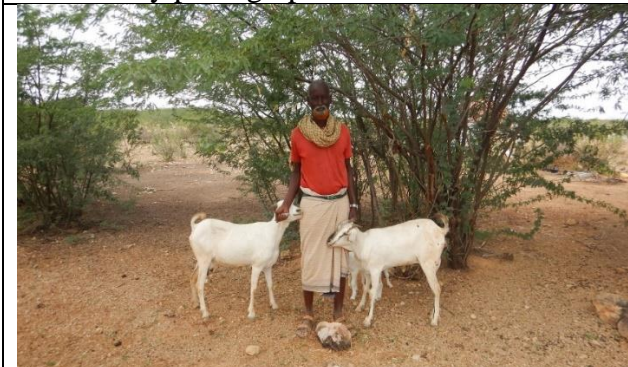
The beneficiary has purchased 2 female reproductive goats after all Beneficiary payments completed