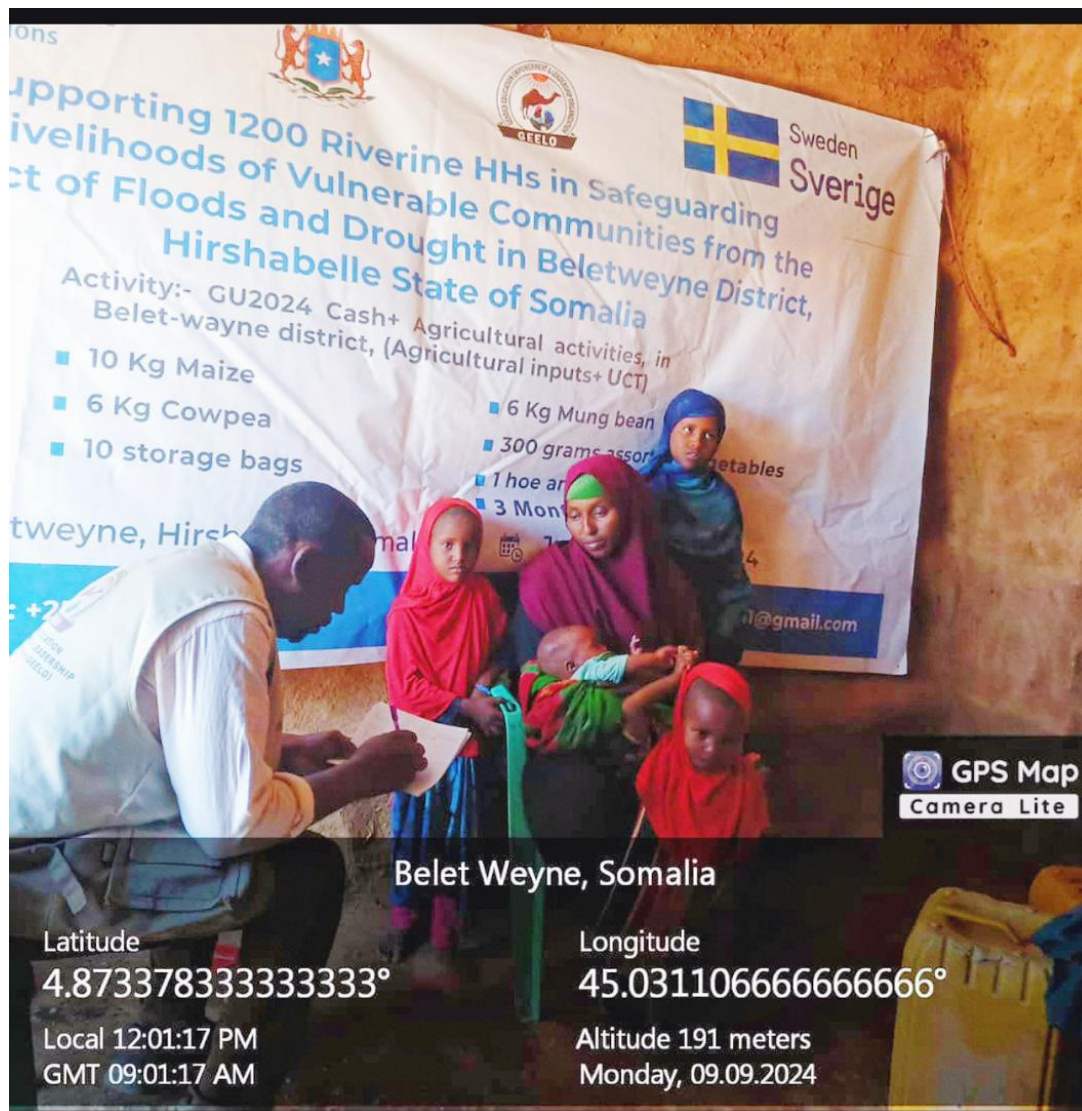
Fig. 6. Photo showing photos of one of the women-farmer beneficiaries of the GEELO project sharing her story with project staff.